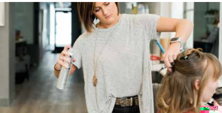
Apprenticeships – your opportunity to learn and earn